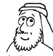
Judas son of James